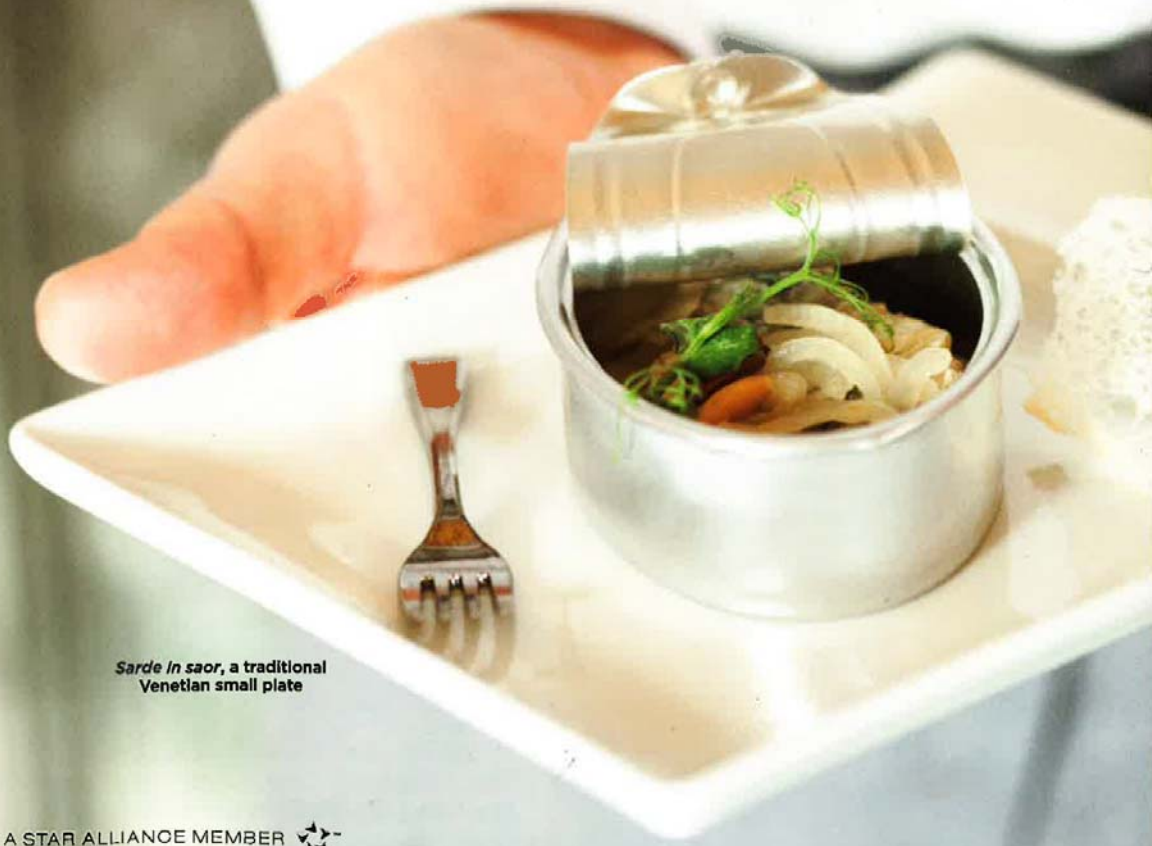
Sarde in saor , a traditional Venetian small plate